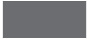
Schéma d'une cellule